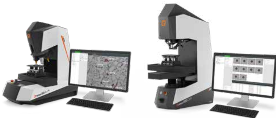
Figure 3: Qness 60 A+ EVO (left) and Qness 200 CSA+ (right) hardness testers